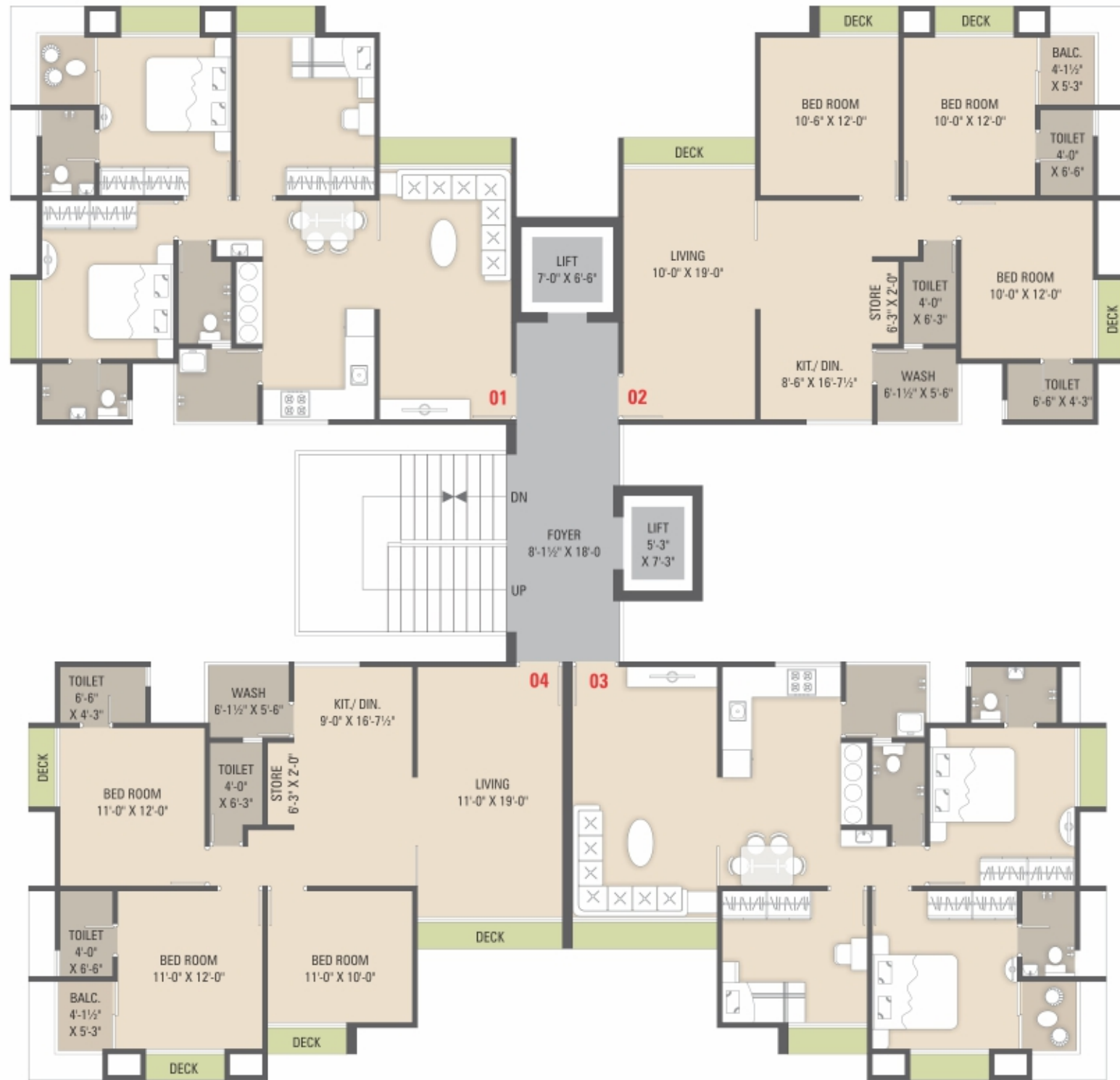
FLAT NO.: 01 & 02 RERA C.A. - 858.00 SQ.FT. | WASH & BALCONY - 60.00 SQ.FT.