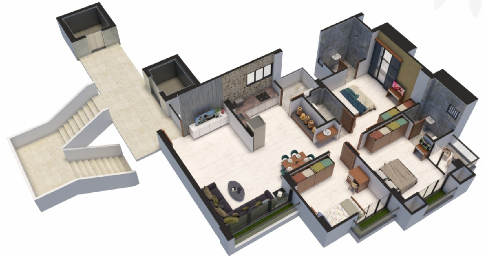
A | TYPE UNIT VIEW