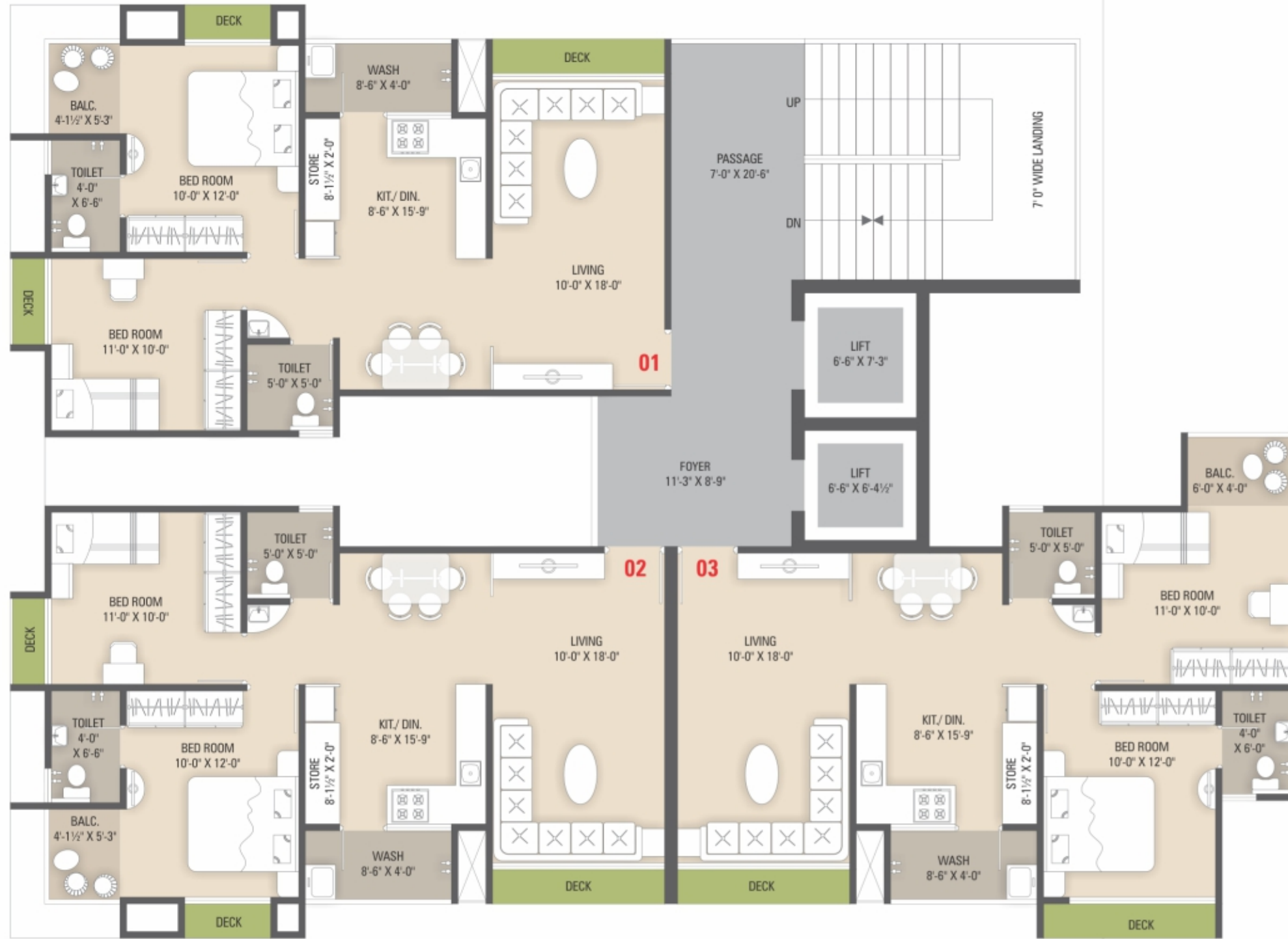
FLAT NO.: 01 & 02 RERA C.A. - 664.00 SQ.FT. | WASH & BALCONY - 61.00 SQ.FT.