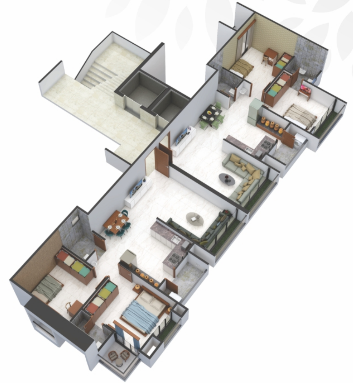
B | TYPE UNIT VIEW